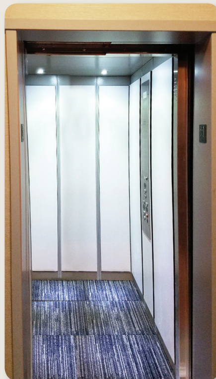
CUSTOM LU/LA ELEVATOR CAR with laminate applied panel in Designer White over painted gray steel panels.