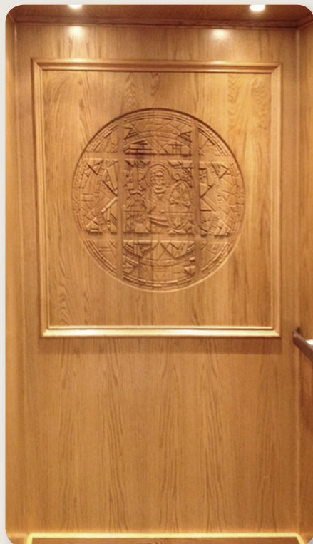
CUSTOM HARDWOOD LU/LA ELEVATOR CAR with applied molding and customer-specific wood-carved design.