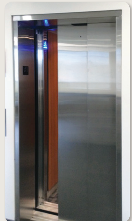
LU/LA ELEVATOR CAR with stainless steel doors.