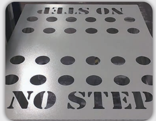
Optional top with safety warning