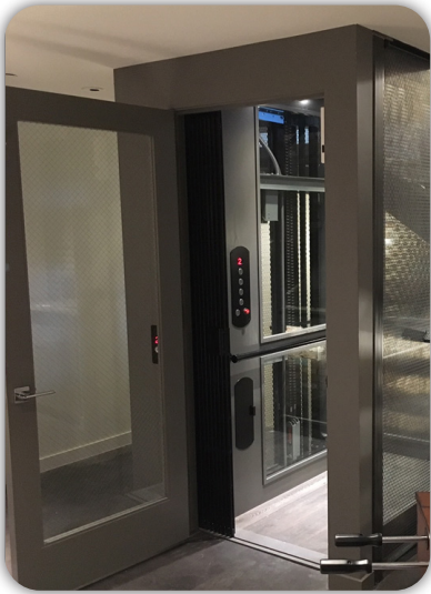
Elevator car features Shaker panels prepped for glass with custom paint finish and flooring.

Symmetry is masterful at creating custom residential elevators designed and built to reflect your personal taste and complement your surroundings.