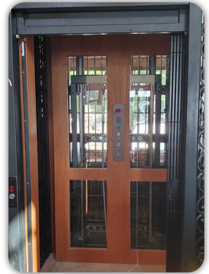
Elevator car features Unfinished Mahogany Flat panel walls prepped for glass.