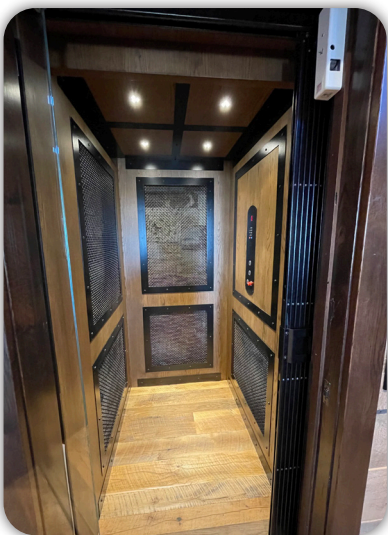
Mine Shaft elevator car in White Oak with stain finish, steel framing and mesh windows in Black and custom hardwood flooring.