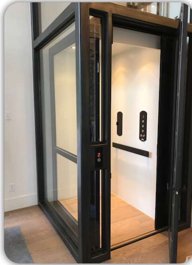
Elevator car features Maple Flat panel with custom stain finish, Black painted steel frame with wall prepped for glass.