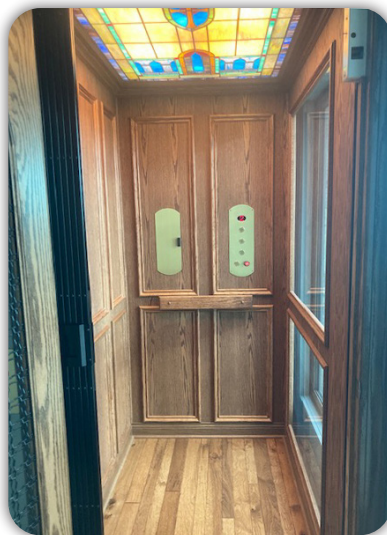
Elevator car with Red Oak panels, custom stained finish, wall prepped for glass and custom stained glass ceiling provided by others.