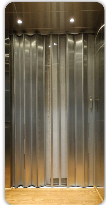
Accordion Door with Solid aluminum and Clear acrylic panels