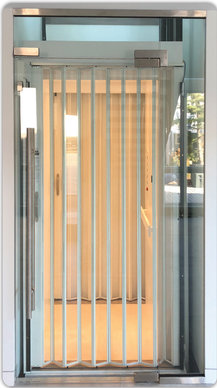
Accordion Door with Clear acrylic panels