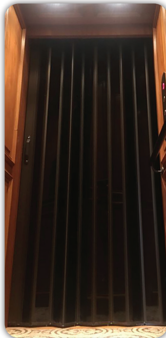
Accordion Door with Black laminate panels