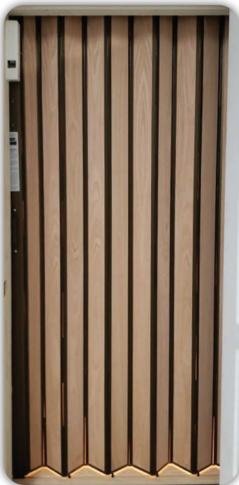
Accordion Door with Light Oak laminate panels