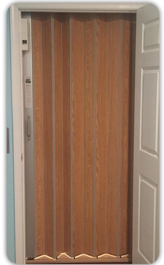
Accordion Door with Oak laminate panels