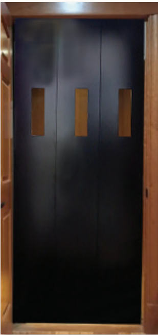
Symmetry Safety 3-Panel Door