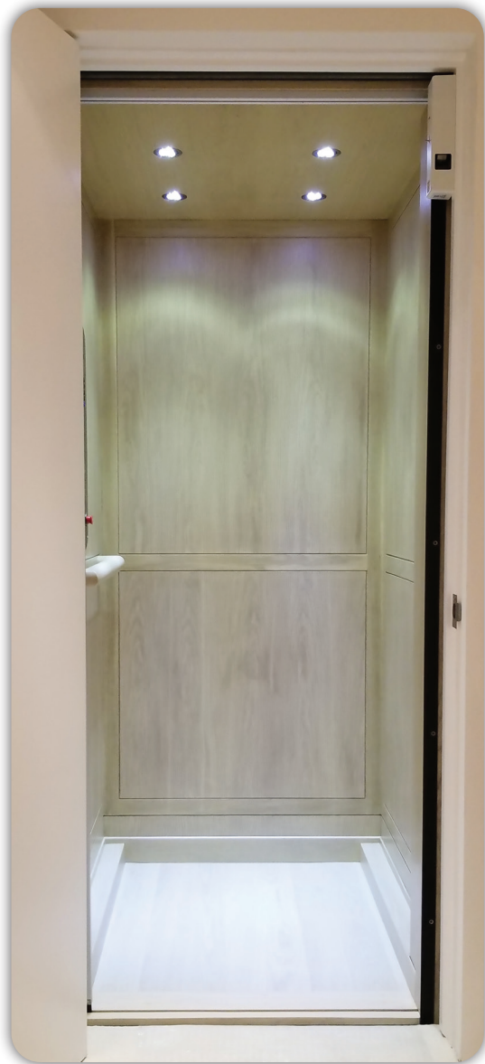
The car flooring and finishing shown is by others and required a 2½" threshold ramp

For Residential Applications where a pit is not feasible